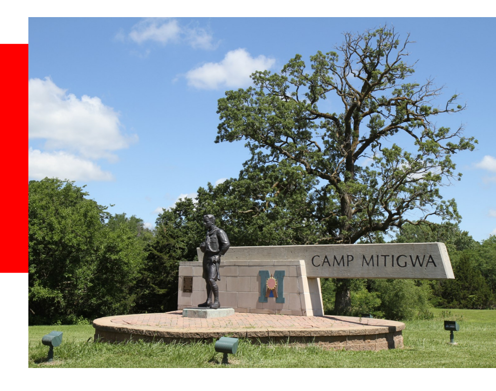
Back to Basics